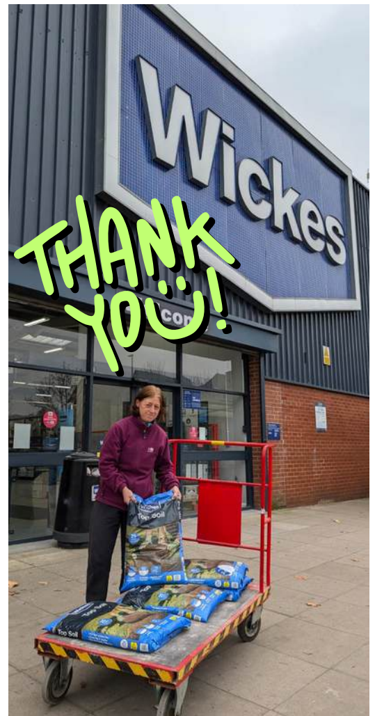
Many thanks to Wickes for donating 5 big bags of top soil for the school garden.